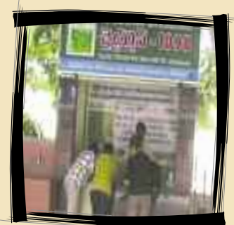
Childline booth at Vijayawada's station.

Children can stay up to seven days at the centre and those who are not returned to their own families will always find a welcoming home and surrogate family at SKCV.