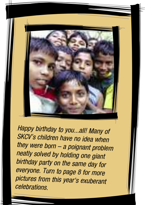
Happy birthday to you...all! Many of SKCV's children have no idea when they were born - a poignant problem neatly solved by holding one giant birthday party on the same day for everyone. Turn to page 8 for more pictures from this year's exuberant celebrations.